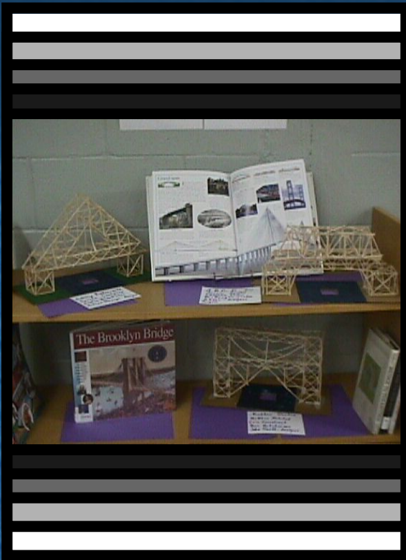
Bridge activity Capital Day School Frankfort